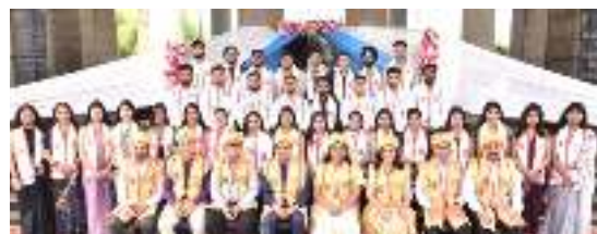
2nd Convocation of Allenhouse Institute of Management

graduates received their degrees and accolades. The event not only recognized the academic achievements of the students but also emphasized the importance of perseverance in overcoming challenges.