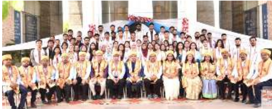
11th Convocation of Allenhouse Institute of Technology