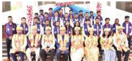
2nd Convocation of Polytechnic

Orient Cables, the esteemed Chief guest inspired the graduates with his words of wisdom and encouragement. The convocation served as a testament to the hard work, dedication, and resilience of the students throughout their academic journeys. Families, faculty, and staff gathered to witness this momentous occasion, filled with pride and joy as